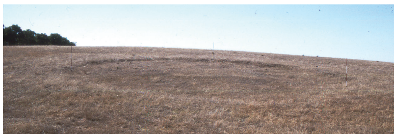
Figure 2 Reservoir Road 1 (VAHR 7822-0492) circa 1991.

Do more earth rings exist along the biik wurrdha (Jacksons Creek) corridor or elsewhere on Wurundjeri Woi-wurrung Country ? If so, what are the implications for our broader understanding of earth rings and their distribution and how they are protected and cared for ?