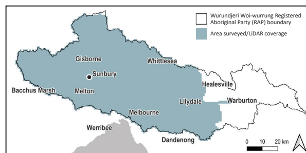
Figure 1 Wurundjeri Woi-wurrung Country, Victoria

Archaeological sites with potential ceremonial associations can help Traditional Custodians to reconnect with places that were once lost due to European invasion, and to learn more about their past. Moreover, the need to identify and conserve these places and their broader cultural landscapes is critical in increasingly urbanised environments. On Wurundjeri Woi-wurrung Country, Victoria ( Figure 1 ), current knowledge about ceremonial sites is centred on the archaeological evidence from five earth rings in Sunbury. This study investigates the potential for identifying similar earth rings elsewhere on Wurundjeri Woi-wurrung Country through archaeological remote sensing.